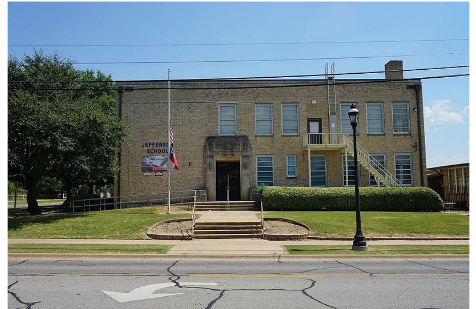
Jefferson Elementary School