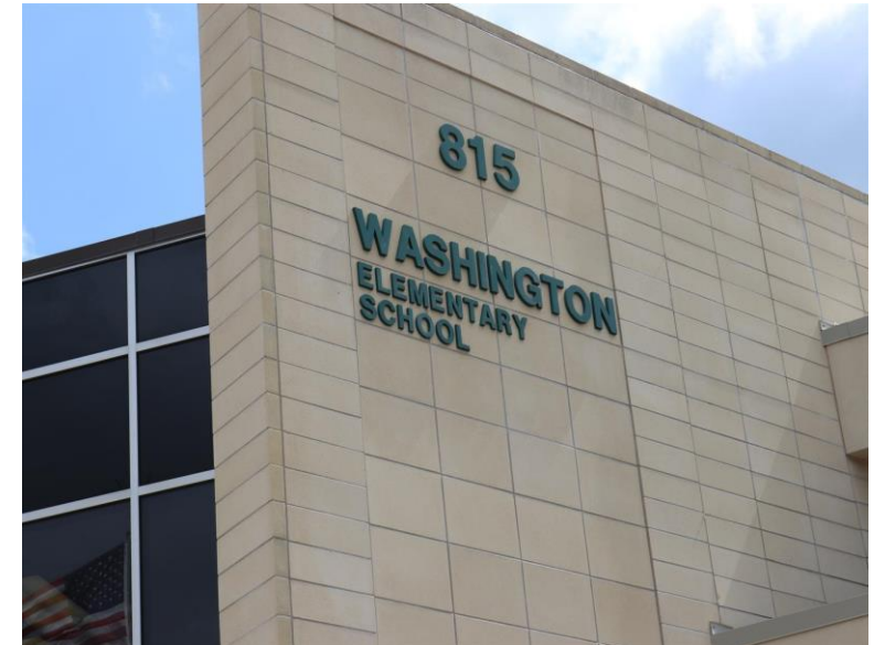
Washington Elementary School