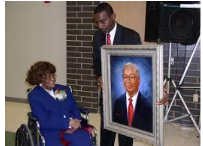
Percy W. Neblett Elementary