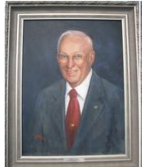
Henry W. Sory Elementary