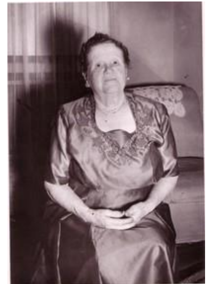
Dillingham Intermediate School