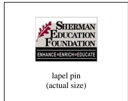
lapel pin (actual size)